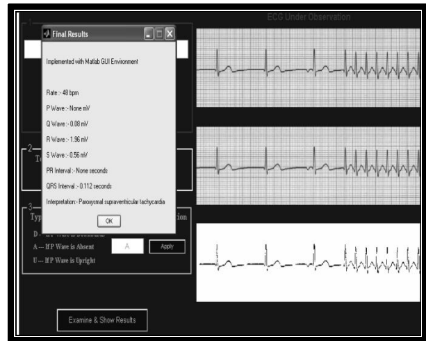
Fig 4: An ECG sample analysis and analysis result

The analysis of various ECG samples is shown in below figures and also collective interpretation is drawn in Table1, The analysis of sample in figure 4 shows that the patient will be suffering from Paroxymal Super ventricular Tachycardia . The analyzing parameter is also shown in the respective figures.