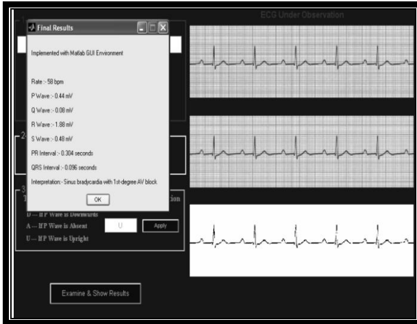
Figure 6: An ECG sample analysis and analysis result

Table 1 gives the collective interpretation of all the sample of the above figures based on the parameters calculated on the basis of the proposed algorithm.