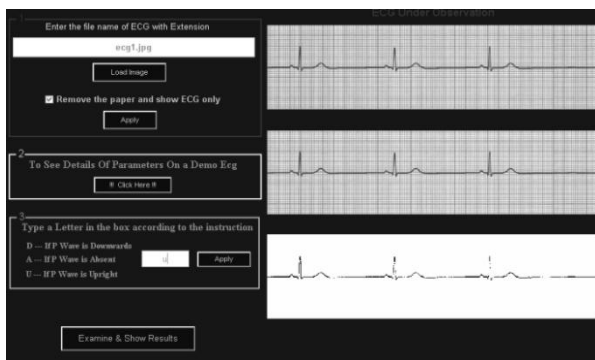
Fig 3: GUI for Proposed Algorithm

GUI has been developed on the basis of above algorithm. In the first step the ECG is taken from database in .jpg format. In the next step it is converted into gray scale and after that paper noise is removed as shown in figure 3. The second part of GUI contains a Demo standard ECG signal for reference. In the third part we have to provide information about the P wave that is P wave is Upright, downwards or absent. In the last section as we click on to the “Examine and Show Result”, The processing of algorithm starts and result will be displayed.