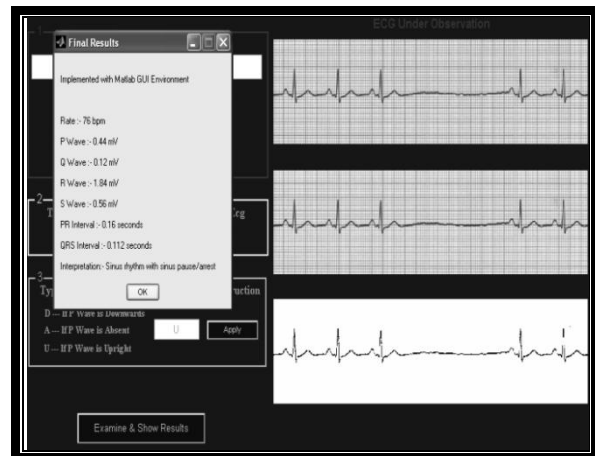
Fig 5: An ECG sample analysis and analysis result

The analysis of sample in Figure 5 shows that the patient will be suffering from Sinus Rhythm with Sinus Arrest . The parameters are tabulated in Table 1