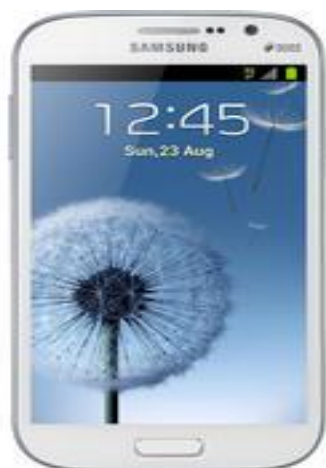
Fig.2 Samsung Galaxy Grand Duos i9082

b) Samsung Galaxy Grand Duos i9082 : It has Android v4.1.2, Jelly Bean 1.2 GHz Dual Core Processor, 5 inch WVGA TFT LCD Screen, 8MP Camera, 8GB of internal storage, 2100 mAh Li-Ion Standard batter [6]. As shown below in fig.2