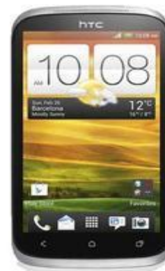
Fig.1 HTC Desire X

a) HTC Desire X: Its look is shown in fig.1 At a Glance it consists of Android v4.0 OS, 5 MP Primary Camera, 4-inch Touch screen, 1 GHz Processor.