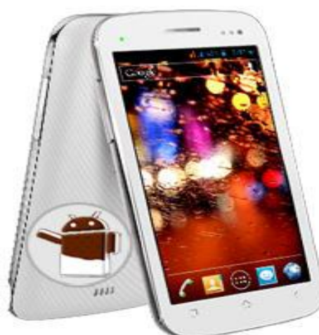
Fig.3 Micromax A110 Super phone Canvas 2

Micromax A110 Super phone Canvas 2: At a glance it has 5" Multi-Touch LCD Screen, Android OS 4.0 ICS, 1 GHz dual-core processor, 8MP Auto-focus LED, Flash camera, Dual SIM, 2000 mAh battery as shown below in fig.3