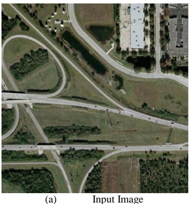
Figure 2 and figure 3 shows results of some of the images. All the roads are detected in the results of first image, but some noises are present in the results of second image. Therefore second image should be subjected to imbalanced data classification.