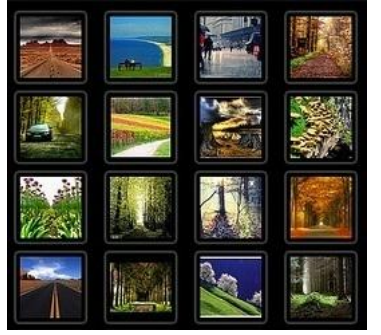
Fig.3. Images in Grid format

User-name and pixel value are being validate from user database. The user will permit for access if the user-name and pixel value is successfully passing the validating process. The user account details are placed in a database that containing user-name and pixel value. Pixel value will be used as authentication key for a password. Pixel value from an image can be encrypted using Image compression