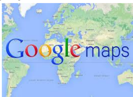
fig.1 Google maps image

Google maps also gives the distance and time for travelling one place to another to the user.