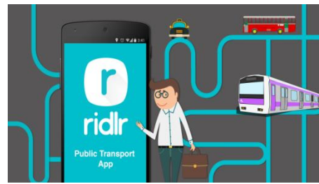
fig.4 Screenshot of Ridlr App

Ridlr is a Public Transportation App which can be used by the users for transportation purpose. The Ridlr app works in many cities of India. The user can use the app to locate nearby bus stops, metro stations and railway stations. The user can previously plan his travel by entering the source and destination.