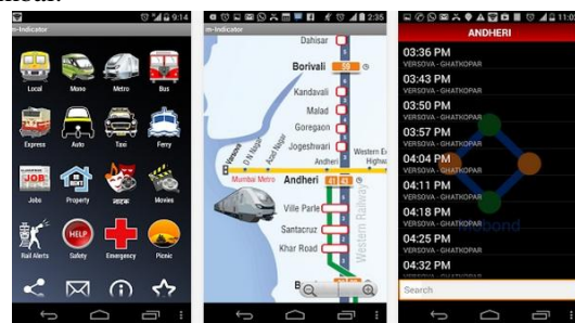
fig.2 Screenshot of M-Indicator app

M-Indicator is one of the most widely used urban transportation mobile application in Mumbai. M-Indicator covers all the major public transport details of the city of Mumbai.