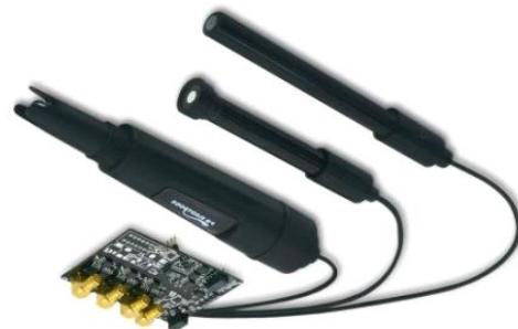
Fig. 3. Smart sensor board +probe wasp mote ODE

1) Smart water sensor: The sensor is used to monitor the quality of water. This is comprised of multiple sensors which measure a dozen of most relevant water quality. Wasp mote is the first device which monitors the water quality by interaction with the cloud. This sensor detects the amount of chemical in water (due to use of pesticides), remote measurements of swimming pool, and salt level in sea water.