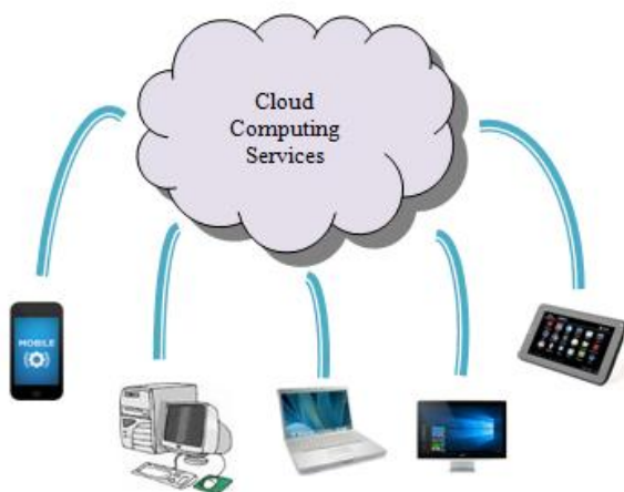
Fig. 1. Cloud Computing Demonstration

Cloud computing is a combination of machines connected via network technologies. This concept may include parallel computing, network storage technologies, load balancing, virtualization and lots more [5]. Figure 1 demonstrates the concept of cloud computing environment in a better way.