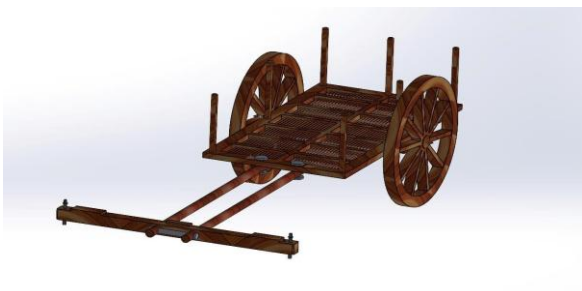
Fig. 1: Traditional Bullock Cart

Material properties corresponding to traditional wood and spring steel were assigned to ensure accurate structural behavior during analysis. The finalized CAD model was then exported to ANSYS Workbench for further finite element analysis.