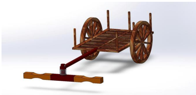
Fig. 2: Proposed Design Bullock Cart